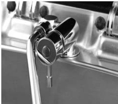
cartridge: ceramik EAN520 installing hole Ø: 32 mm

Mixer brass faucets, cold and hot water, with folding spout. Studied for all type of sinks with glasses-cup.