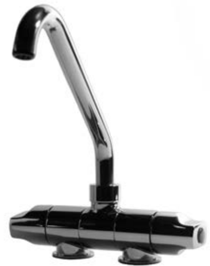
cartridge: mechanical EAN612 installing hole Ø: 19 mm

Mixer brass tap, hot and cold water, with folding spout.