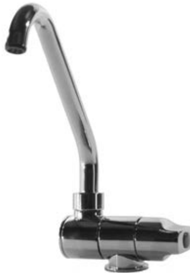
cartridge: mechanical EAN612 installing hole Ø: 16 mm

Single brass tap, only cold water, with folding spout. Studied from Nicola Bettetini in the 1985 is again an actually line.